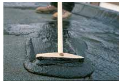
ADHESIVES AND PRIMERS be.iko.com