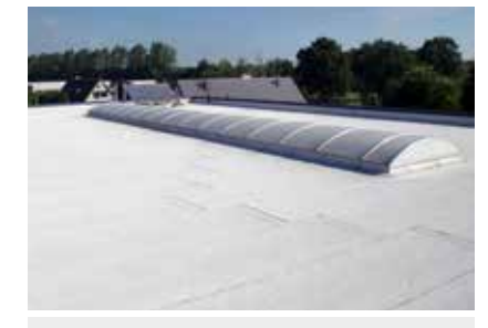
SUSTAINABLE FLAT ROOF WATERPROOFING