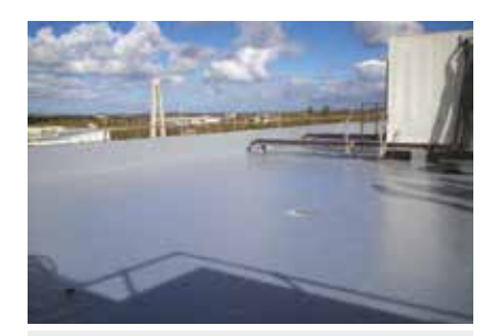
SEAMLESSLY WATERTIGHT www.ikoflexia.com